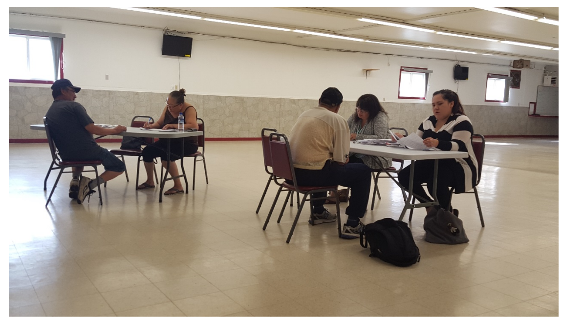
LWIC Fish Project in FRCN, July 2017