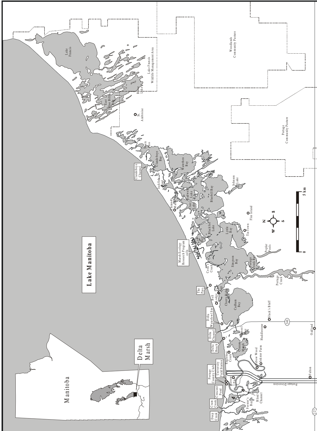
Figure 1. Diagram of Delta Marsh showing the locations of plant collections mentioned in the text.