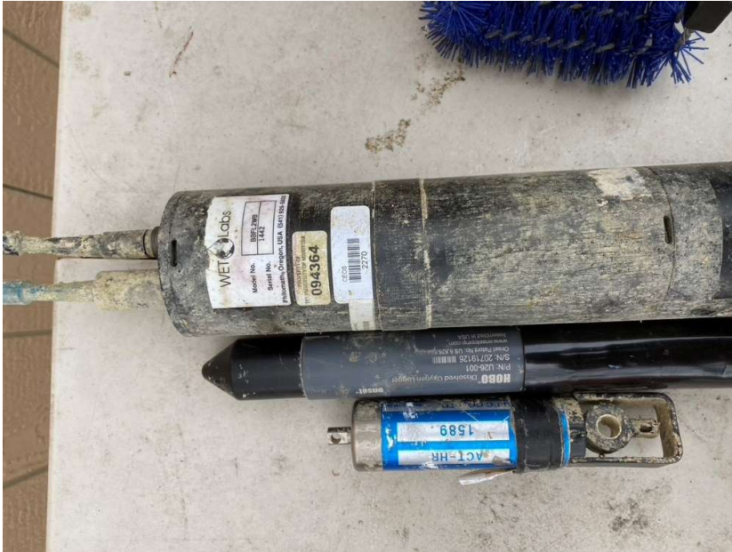
Figure 1. Mooring Instruments after retrieval, October 2020