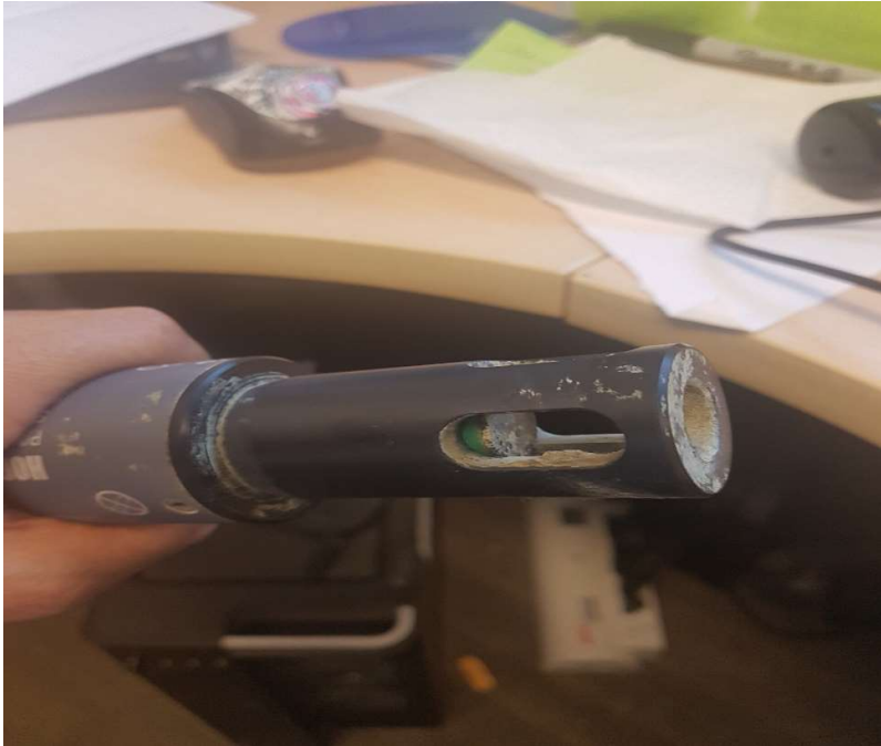
Figure 2. O2 sensor